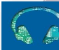
Electronics Fair (Autumn)