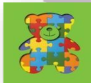
Toys & Games Fair